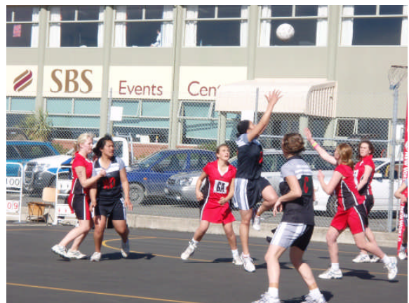
The girls competing in the SISS netball tournament.

how computer games and 3D movies like Shrek are made? Learn the latest in 3D Animation and Games Design on a Bubble Dome School Holiday workshop this September. Other courses in Movie Making, Fashion and Wearable Arts are on offer at different locations throughout the country. Ages 6-17 years. Tel: 0800 GET BUBBLE (438 282) or Email: info@bubbledome.co.nz or Visit: www.bubbledome.co.nz