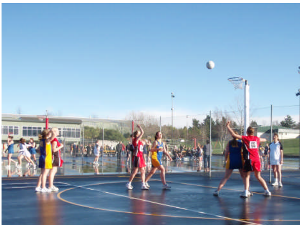
Anticipation as the girls wait to see where the ball will go at SISS netball.